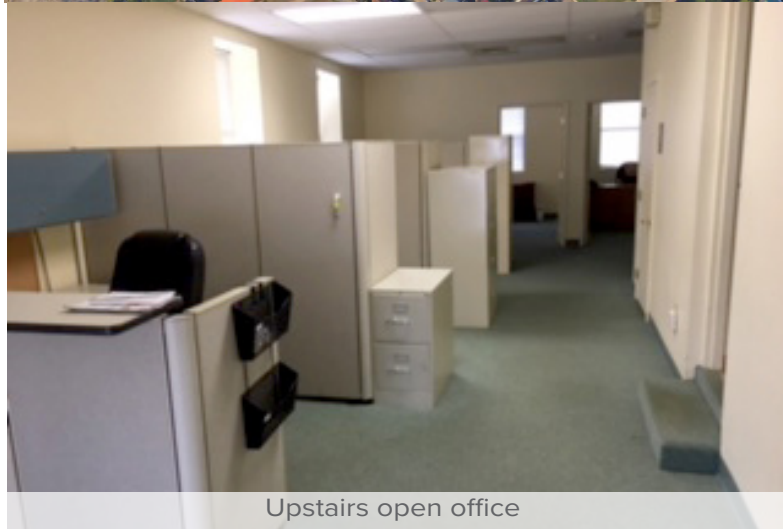
Upstairs open office