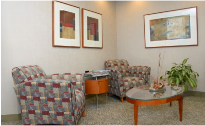
Example build-out: lobby/waiting room