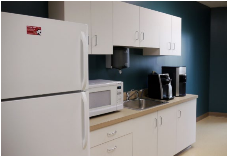
Example build-out: kitchen/break room