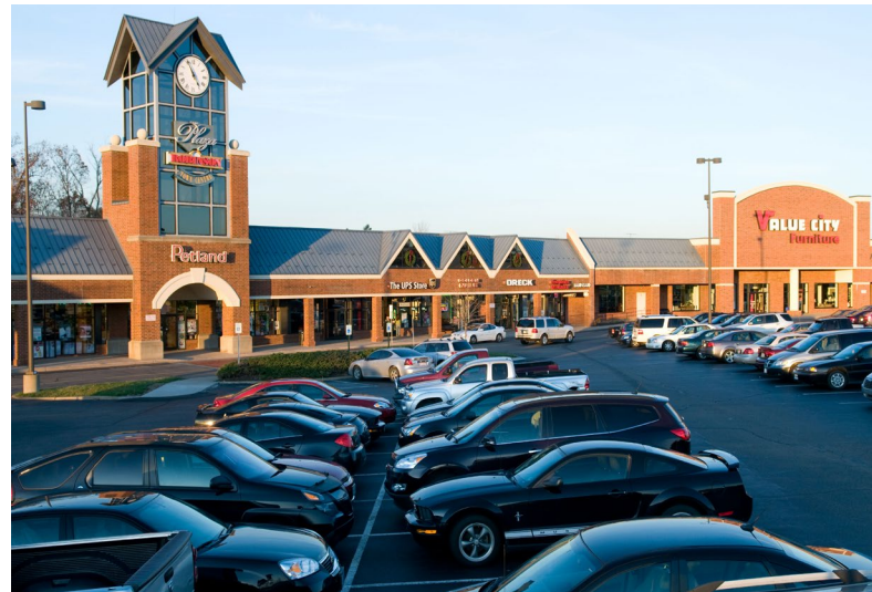
Nearby attractions: Robinson Town Center/The Mall at Robinson