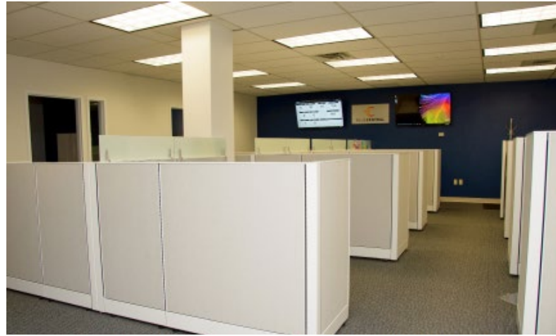
Example build-out: open office area